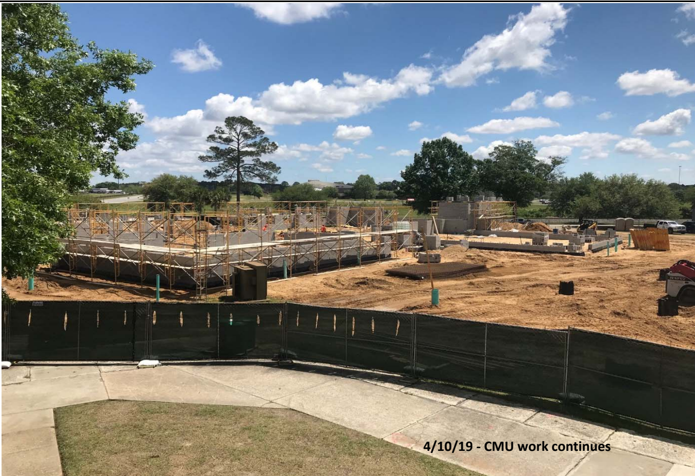
4/10/19 - CMU work continues