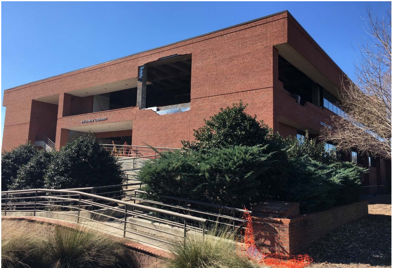
Update 1-28-2019 - Selective demolition of the Carlton Center continues