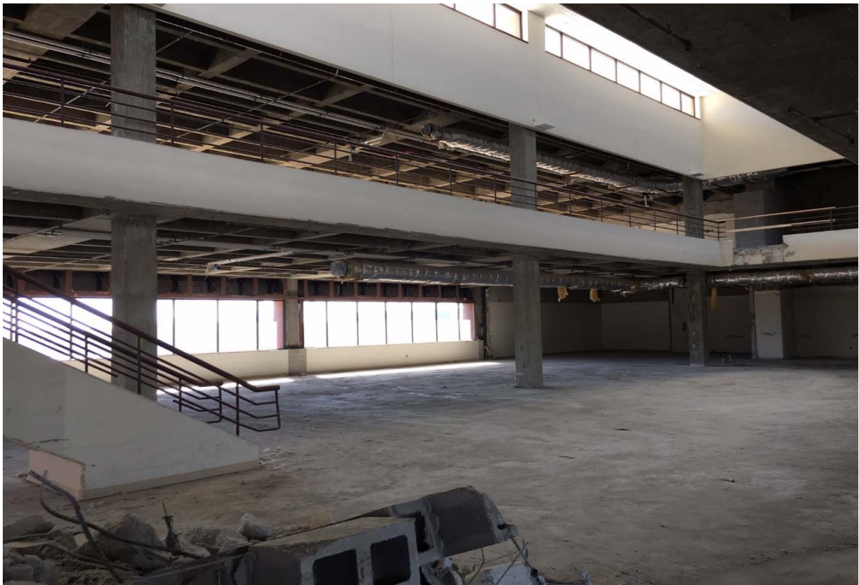
Update 1-22-2019 - Selective demolition of the Carlton Center interior continues