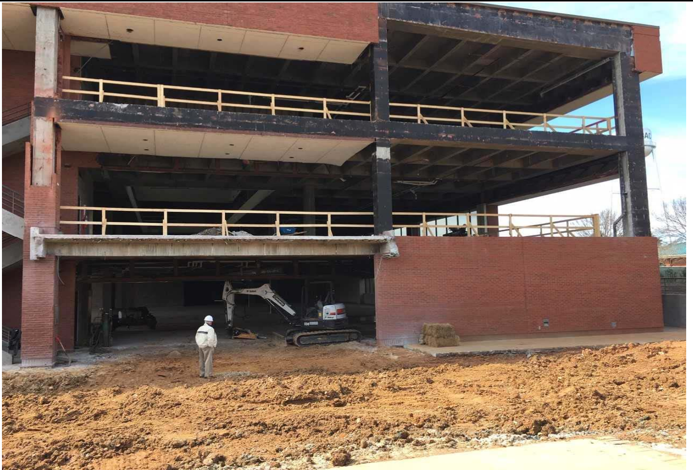
Update 2-12-2019 - The stairs and ramp (affectionately know as the cattle shoot) are gone!