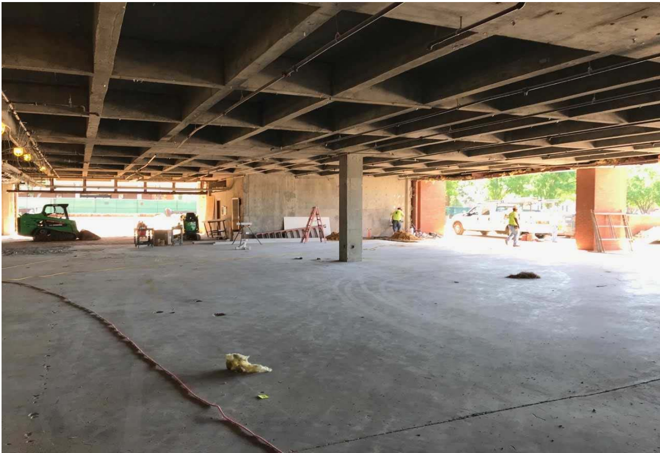
Carlton Center 4-10-19 Update Wall penetration work continues