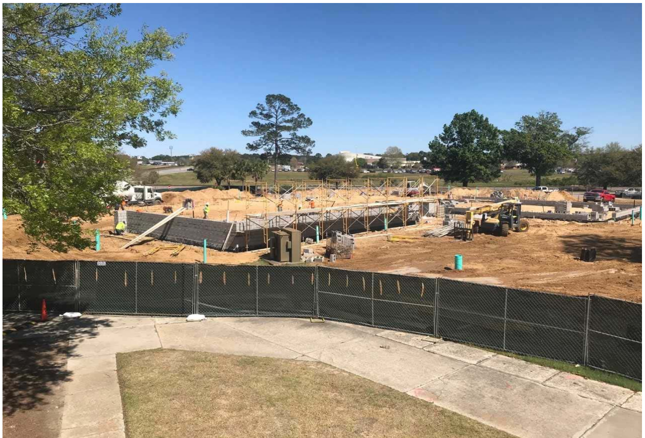
Carlton Center Update 3/29/19 Electrical, HVAC & Plumbing begins