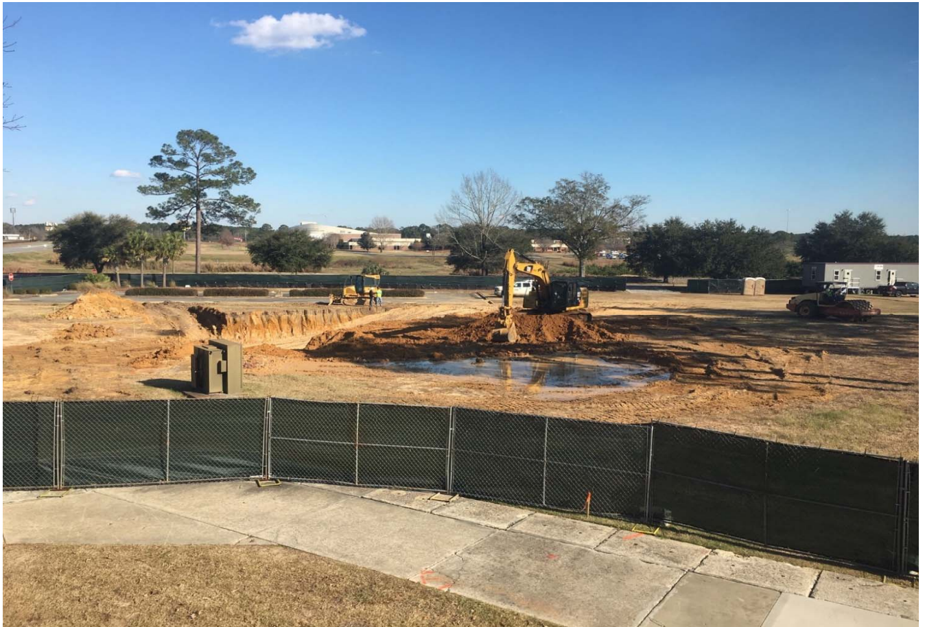
Update 1-28-2019 - Foundation work for the new Fine Arts building on Sweetheart Circle begins