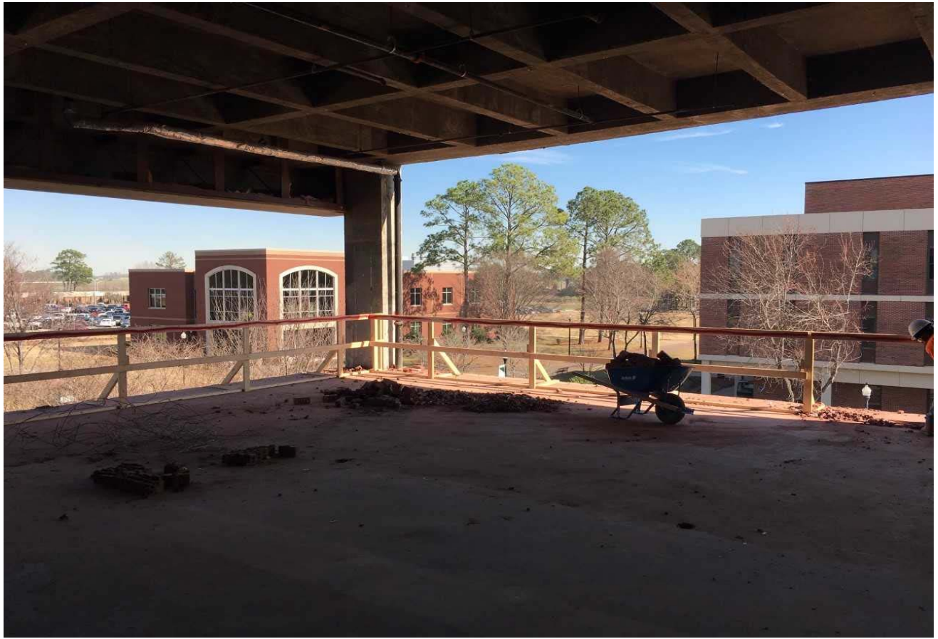
Update 2-12-2019 - Demolition continues - 3rd floor looking northeast