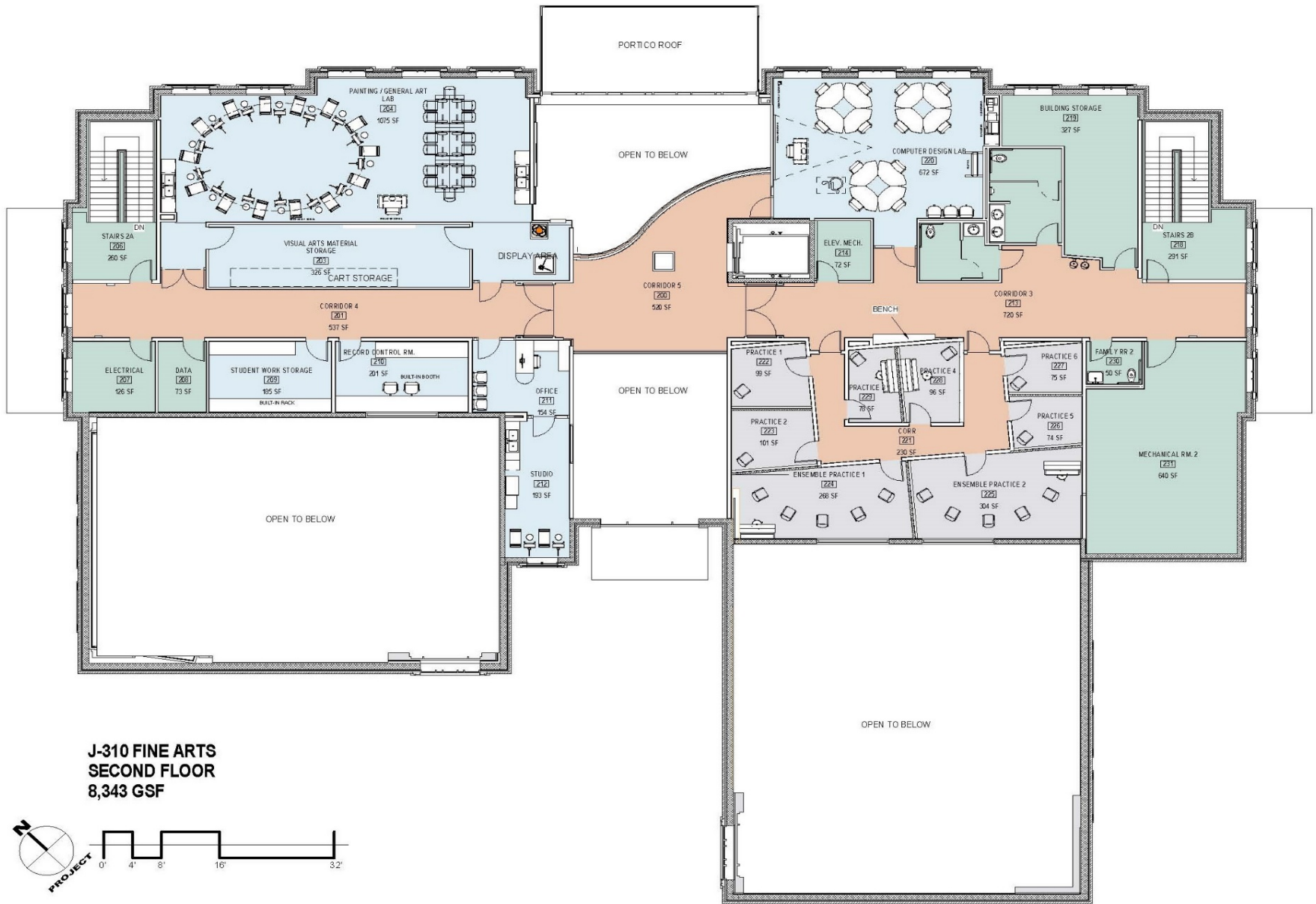
Fine Arts - Second Floor