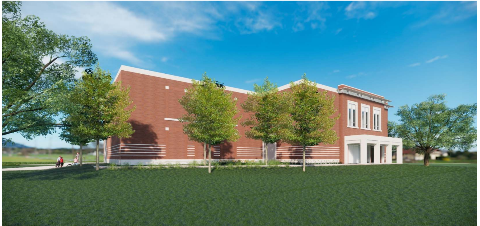
View From Moore Highway